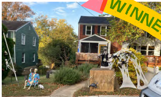
5812 Edgehill Drive