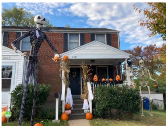
2617 Jefferson Drive