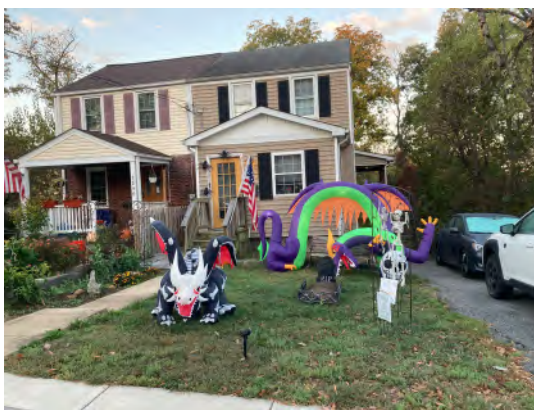
5844 Edgehill Drive