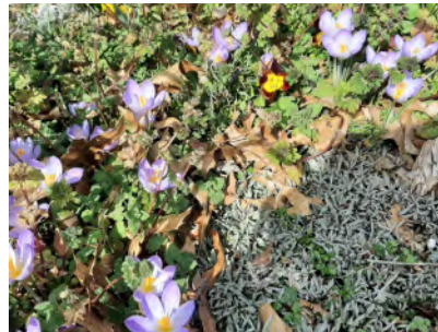
Spring is coming to the Manor! More in Home and Garden pg 3.

Las elecciones de la Junta Directiva de la JMCA se llevarán a cabo durante la Reunión Comunitaria el 14 de marzo a las 7pm. Se requiere estar presente para votar, así que marque su calendario. Consulte la página 8 para obtener más información.