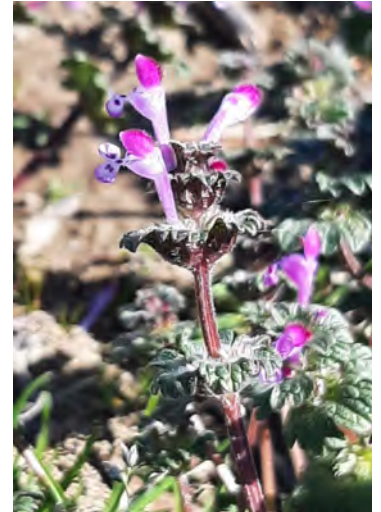
Hen Bit Flowers